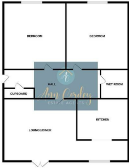
TOTAL FLOOR AREA: 1661 sq ft (154.3 sq m.) approx.